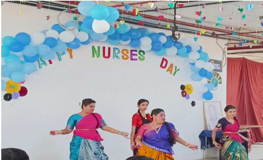
Semi classical fusion dance gracefully performed by Bsc 4 th year