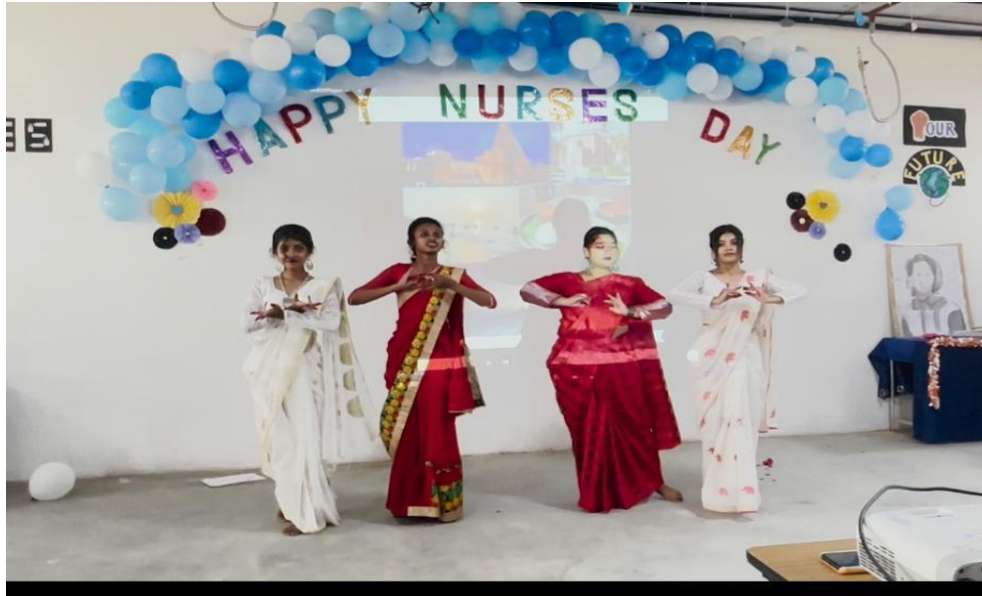
Students presenting Kathak from uttra pradesh