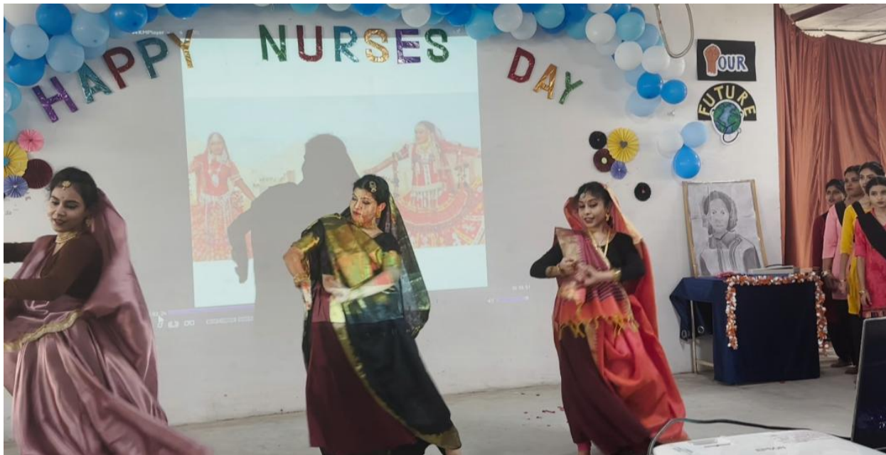
Students representing Rajasthan