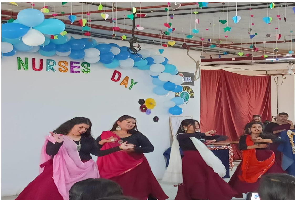
Indo-western dance was beautiful performed by 2 nd year Gnm